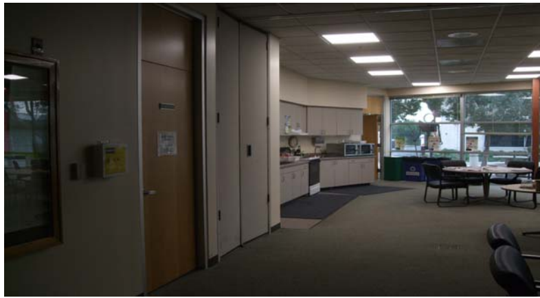
Fig-3: Hall leading toward lunchroom. A/V door is on the left.