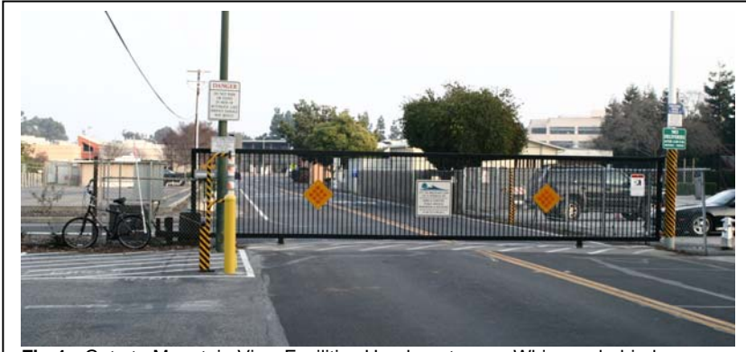
Fig-1: Gate to Mountain View Facilities Headquarters on Whisman behind Fire Station 4