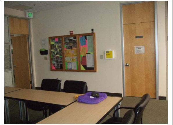
Fig-4: A/V door at right, door to building entry at left.