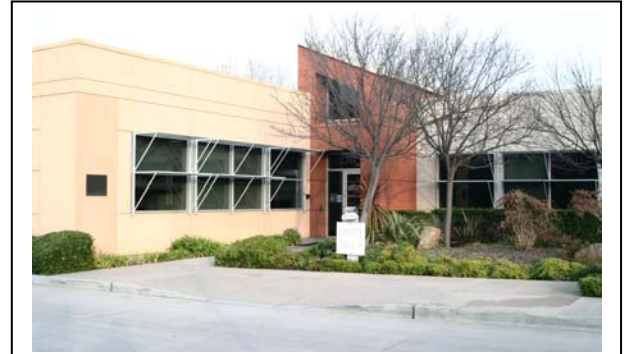
Fig-2: Facilities Administration building entrance where the Alternate EOC is located.