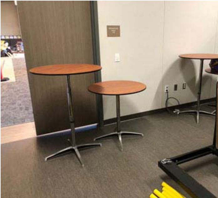
CC-4 – Antenna drop room