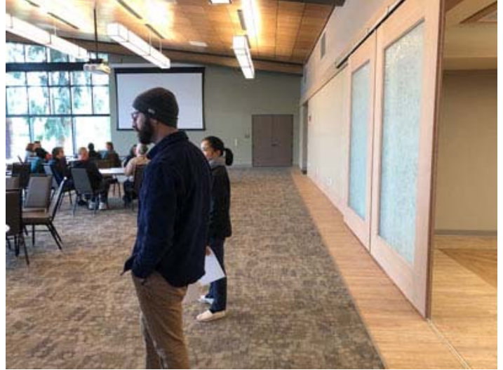
CC-3 – Door at end of Redwood Hall