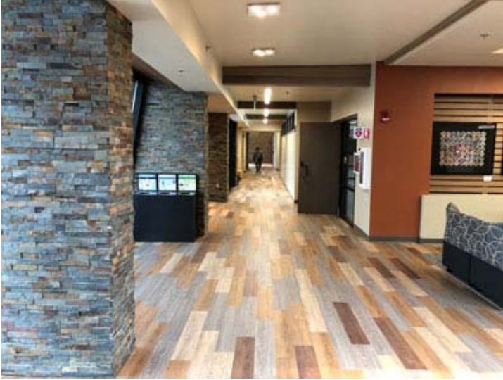
CC-2 – Hallway leading to Redwood Hall