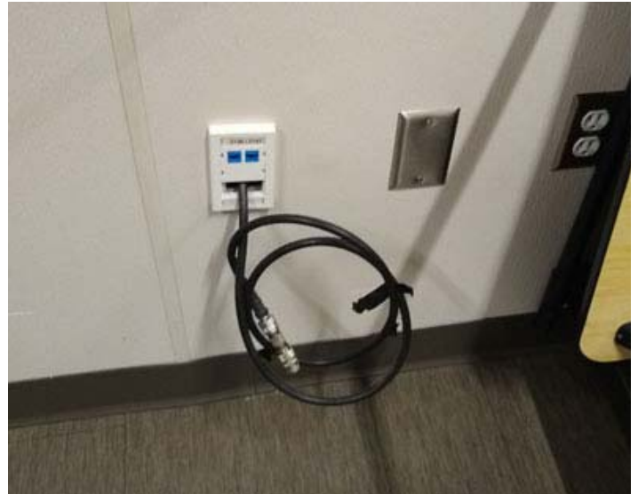
CC-5 – Antenna hangs from outlet