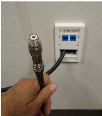
CC-6 – Antenna Connection