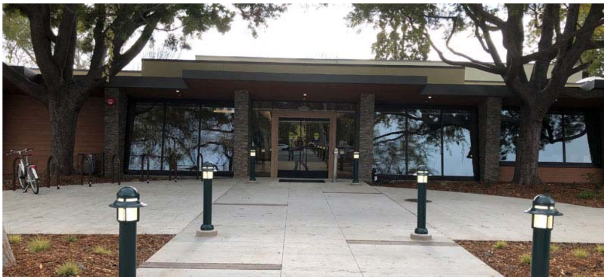
CC-1 – Front view of Community Center