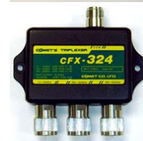
Duplexer and triplexer