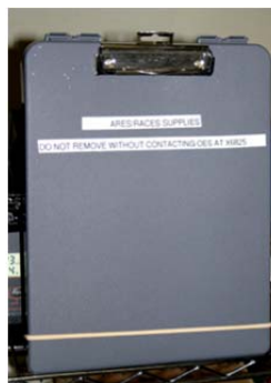
Clipboard / storage container