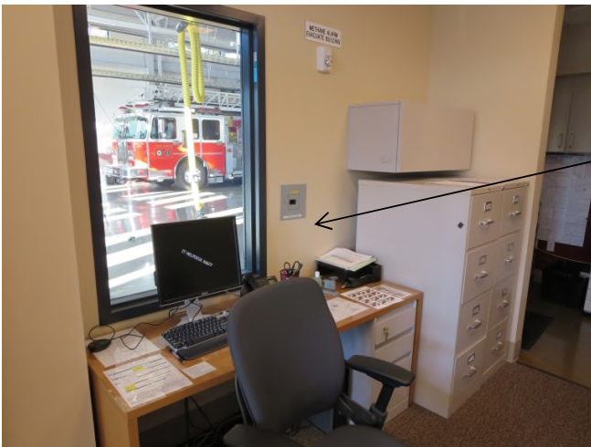
FS5-4 – View of desk with Antenna Drop Box