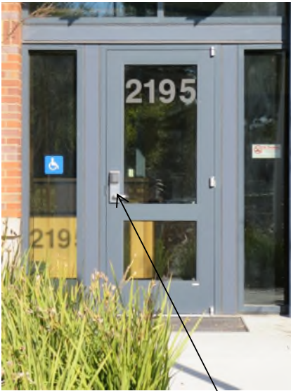
FS5-2 – Front Door w/keypad