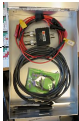
FS5-7 – Contents of Clipboard