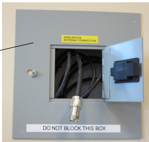
FS5-5 – Antenna Drop Box (open)