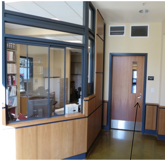
FS5-3 – Foyer upon entry