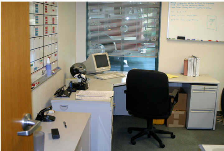
FS1-5 - Captain's Office to the left of the FAP closet