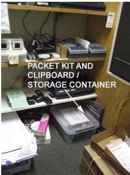
FS1-7 – Packet Kit and Clipboard/Storage Container