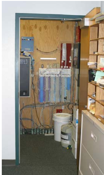
FS1-3 – FAP Closet open