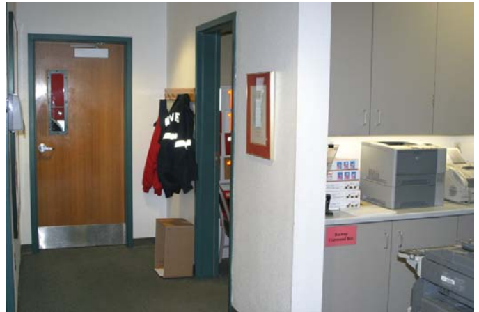
FS1-6 - Hall to the left of the hall for the FAP Closet