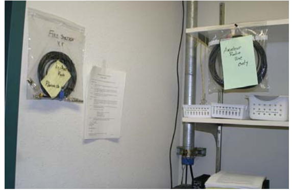
FS1-4 – Cable drop and extra cables inside and to the left of the FAP closet door