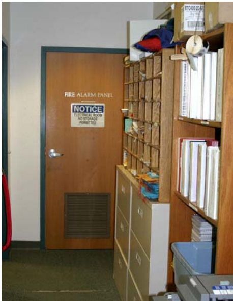
FS1-2 – Fire Alarm Panel Closet