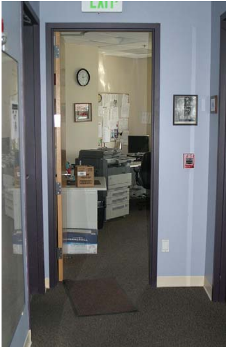
FS2-3 – View through door to office where the antenna drop is located