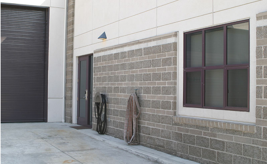
FS2-2 – Entrance to Fire Station 2 off of the rear parking lot