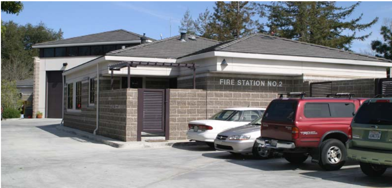
FS2-1 – Parking Lot in rear of Fire Station 2