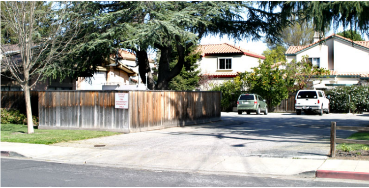
FS3-2 – Entrance to parking lot in the rear of the station, entrance from Montecito