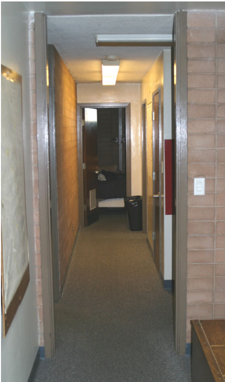
FS3-4 – The antenna drop is in the last office to the right at the end of the hall