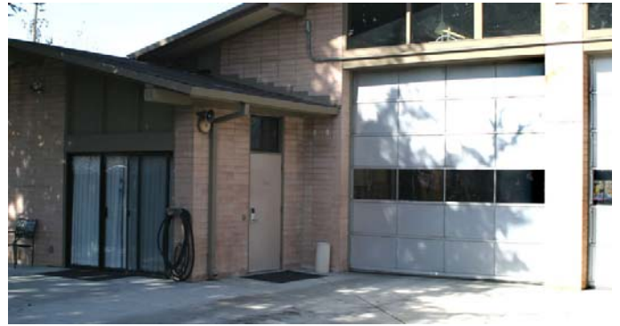
FS3-3 – Rear entrance to Fire Station 3