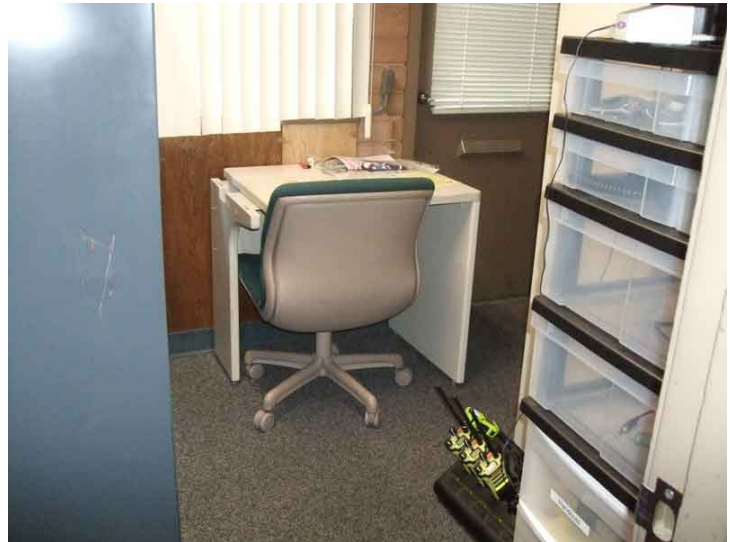
FS3-5 – Desk for radio setup. Packet kit and clipboard storage container are in gray cabinet left of desk.