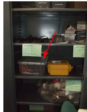
FS3-7 – Packet kit and clipboard container in big metal cabinet left of desk.