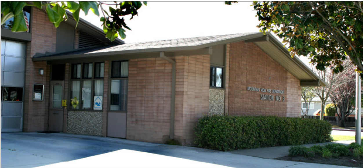
FS3-1 – Front of Fire Station 3