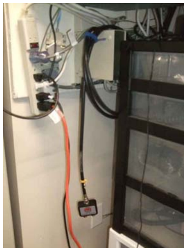
FS3-6 – Cable drop and power strip to the right of the desk.