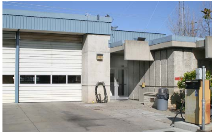
FS4-3 – Rear entrance to fire station