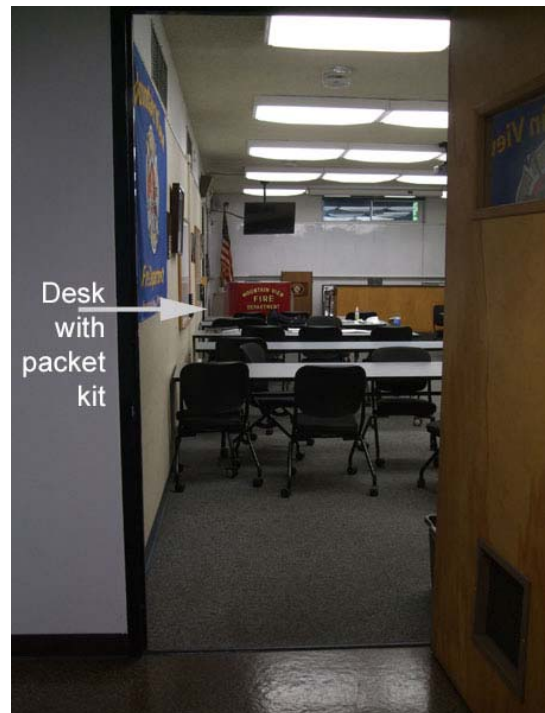
FS4-5 – Classroom . Packet desk is on the stage behind the red podium. Furniture in front may vary.