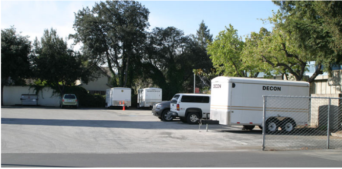
FS4-2 – Parking lot at the rear of the fire station