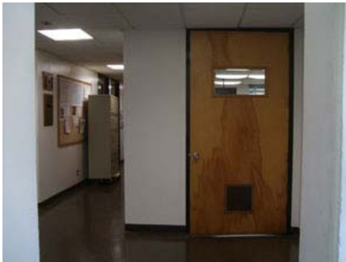
FS4-4 – Classroom door is to your right when you enter the rear of the building.