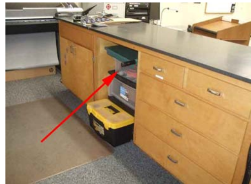
FS4-7 – Packet kit in cubby of cabinet on stage.