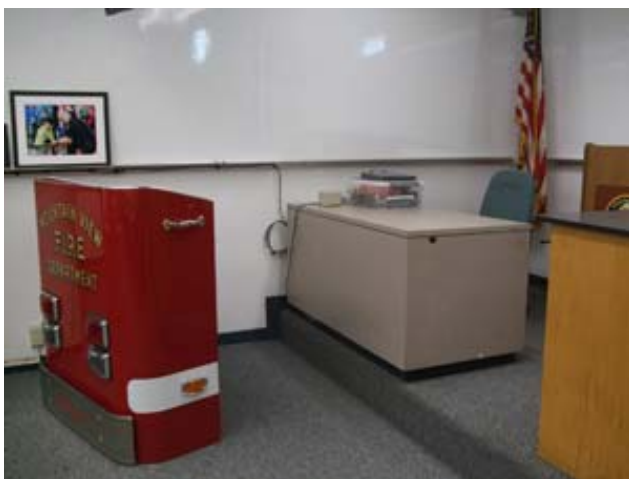
FS4-6 – Desk with packet kit and clipboard container on top, and antenna drop.