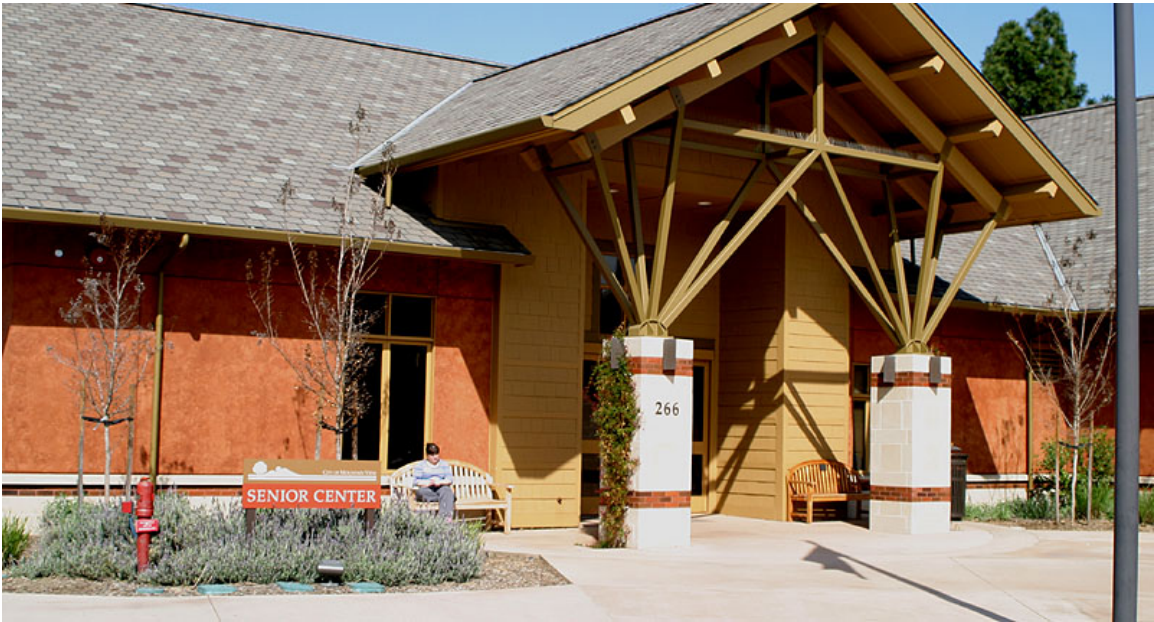
SC-1 – Front entrance of Senior Center