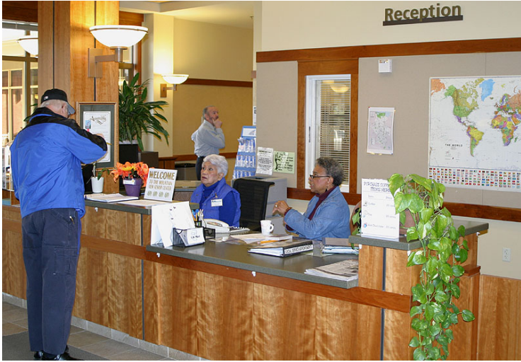
SC-2 – Front desk to the right after you enter