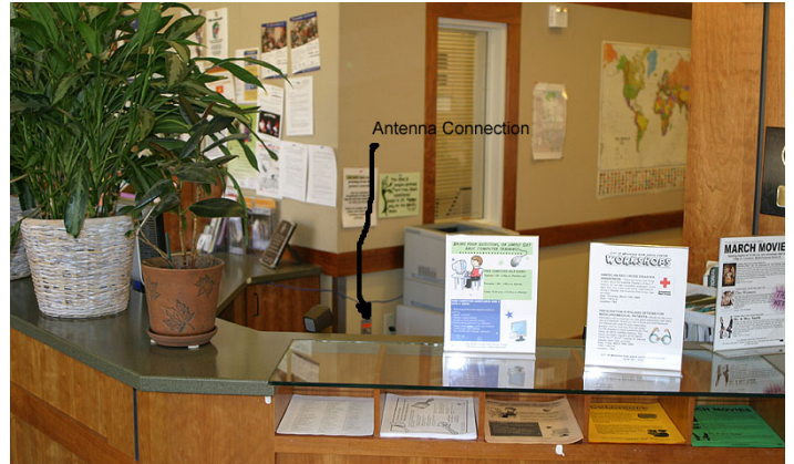
SC-3 – View to the left of SC-2 showing Antenna Connection on wall behind the desk